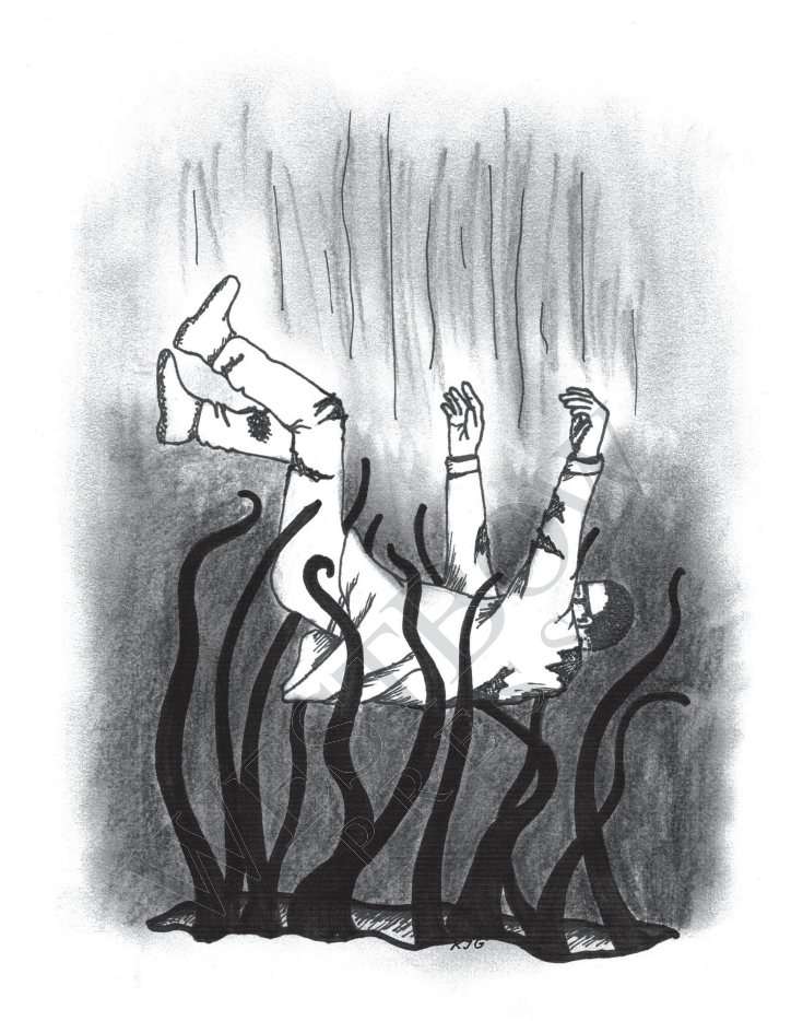
Falling into the Abyss