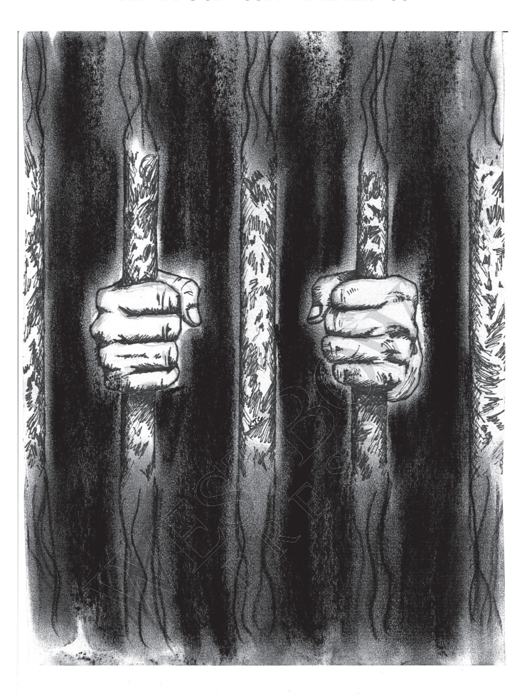
Let Me Out of This Gloom